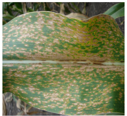
Figure 2. Severe GLS leaf infection.