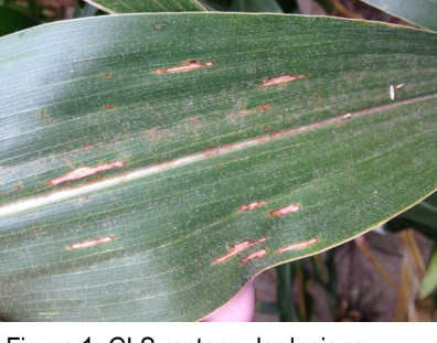
Figure 1. GLS rectangular lesions.