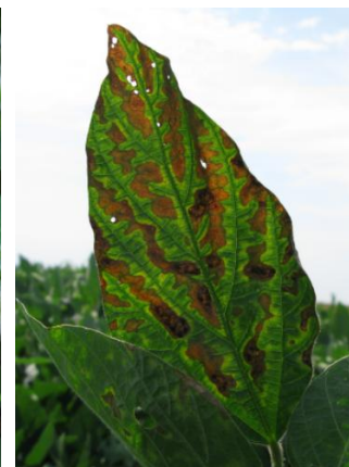
Figure 3. Soybeans damaged by sudden death syndrome.