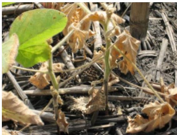
Figure 1. Soybean seedlings damaged by Phytophthora root rot.

include lower seeding rates or wider row widths to increase air flow in the canopy for suppression of foliar diseases. Planting later in the season or planting soybean