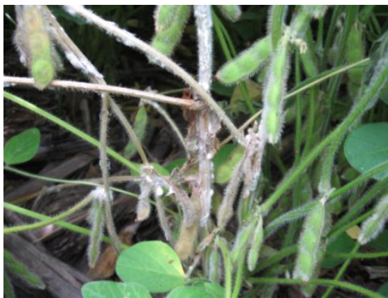
Figure 2. White mold infected soybean plants.