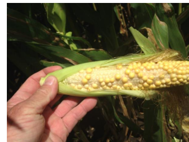
Figure 6. Poor kernel set as a result of silk damage caused by corn rootworm.

Scout and Protect Silks - Adult CRW populations should be monitored around tasseling to determine if adult control measures are warranted to protect silks from clipping (Figure 5). Silk clipping can prevent ovule fertilization, which results in aborted kernels (Figure 6). In some regions, the economic threshold of five beetles/plant may justify a foliar insecticide application to protect silks. 4 University guidelines should be followed for the thresholds. Adult scouting can also help determine the potential for infestation in future corn crops.