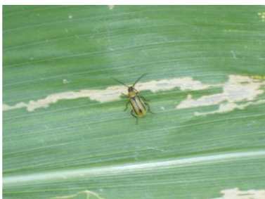
Figure 2. Western corn rootworm adult.