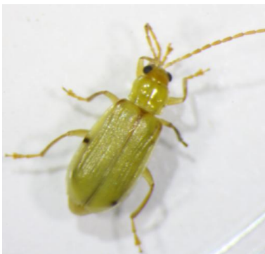
Figure 1. Northern corn rootworm adult.

The Northern corn rootworm ( Diabrotica barberi Smith & Lawrence) (NCRW) and the Western corn rootworm ( Diabrotica virgifera virgifera LeConte) (WCRW) are the prominent corn rootworm (CRW) pests in the Midwestern states. The NCRW adult is cream to tan in color upon emergence, but turns to pale green and is about 1/4 inch long (Figure 1). The WCRW adult is yellow to green in color, has black stripes on the wing covers, and is about 5/16 inch long (Figure 2). 1 The male's stripes usually appear wider and may coalesce. The females of the two species are generally larger than the males.