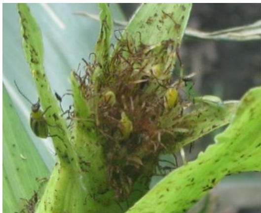
Figure 5. Adult corn rootworm beetles feeding on silks.

continuous corn operations where CRW populations are known to exist and where NCRW extended diapause variants were known to be present in a corn crop two years prior and root lodging occurred, corn products with insect protection should be considered. If non-B.t. protected corn products are planted into continuous corn situations or when extended diapause variants were known to be present in a corn crop two years prior and root lodging occurred, a soil applied insecticide (SAI) should be considered; however, SAIs may be difficult to handle, require expensive application equipment that most growers who rotate are lacking, add costs, and have been known to be inconsistent in their performance. Additionally, root digs, which normally occur in late-July are imperative to help evaluate CRW larval damage and assess CRW management strategies. The Iowa State Node-Injury Scale can be used to evaluate feeding damage ( www.ent.iastate.edu ). 5 Weeds and volunteer corn should be managed in soybean fields as pollinating weeds and corn can attract CRW beetles.