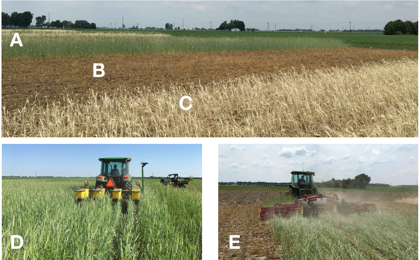
Figure 2. Cereal rye cover crop treatments: rye ready to be crimped (A), herbicide application 14 days prior to planting (B), herbicide application at planting (C), soybean planted into rye prior to crimping (D), crimping of cereal rye following soybean planting (E).