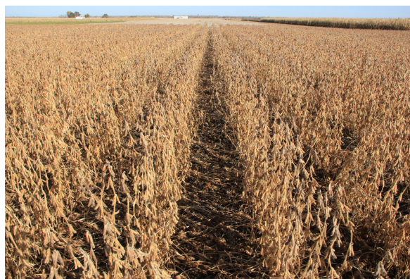
Figure 3. High Management without the fungicide and insecticide treatment.