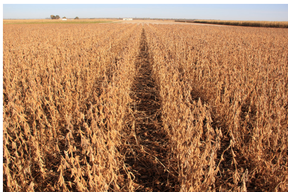
Figure 2. Base Management with the fungicide and insecticide treatment.