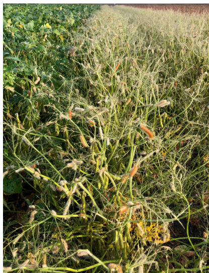
Figure 4. Feeding from salt marsh caterpillar required the late application of insecticide on 9/20/18. Caterpillars moving from senesced early-planted soybean caused large amounts of defoliation to the border rows of this trial, and the trial was treated to prevent further defoliation.