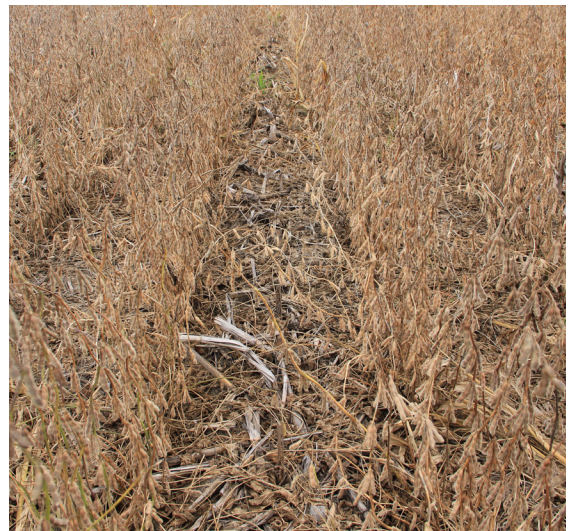
Figure 2. More late-season growth from green stems was observed with a fungicide treatment (left) compared to no fungicide (right).