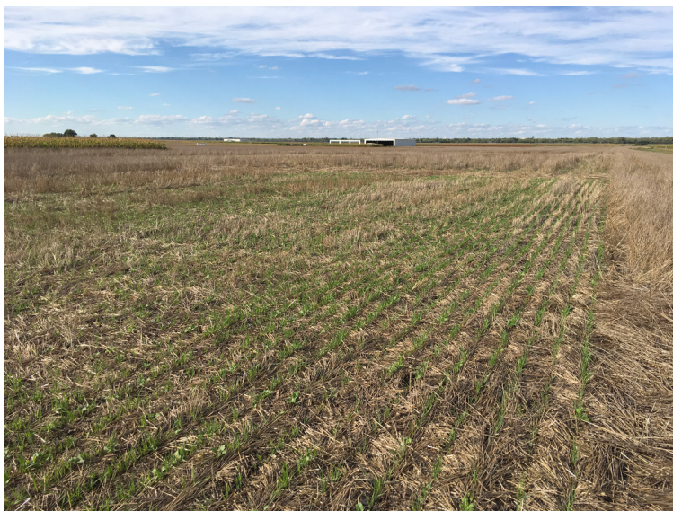
Figure 1. Stubble height and cover crop treatments with low stubble height in the foreground and taller stubble heights in the background on September 25, 2017.