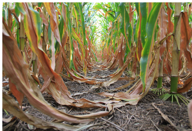
Figure 4. (Left image) low stubble height with no cover crop at the end of the growing season. (Right image) low stubble height with the winter hardy mix at the end of the growing season.