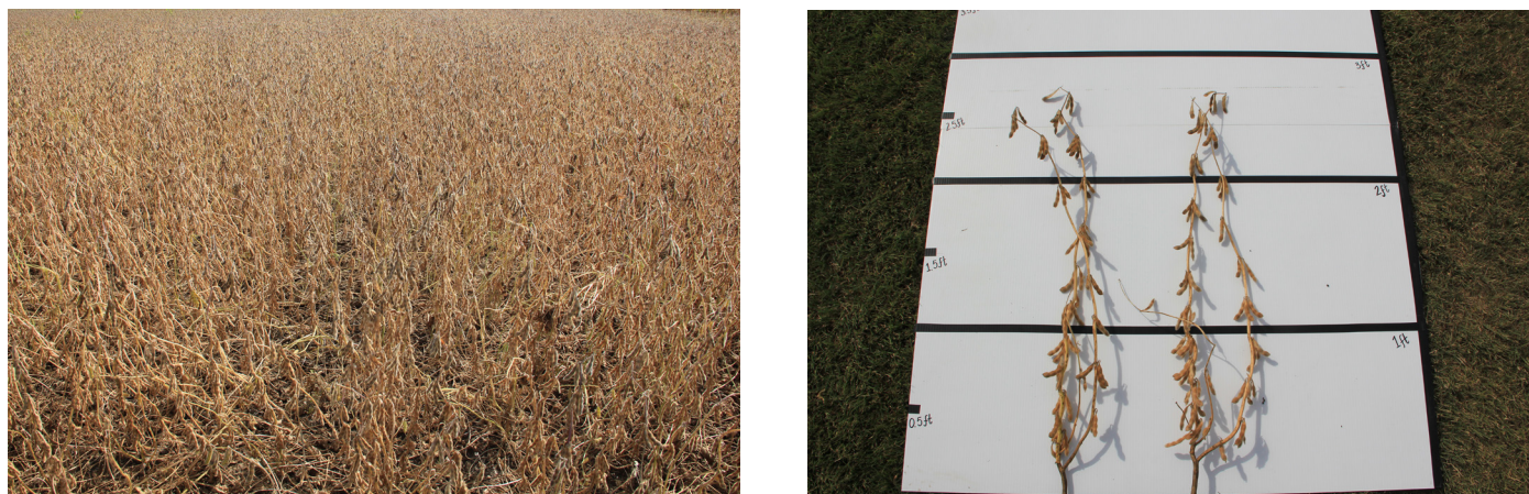
Figure 2. Field (left) and plant architecture (right) of soybean in 7.5-inch rows at 160,000 seeds/acre.