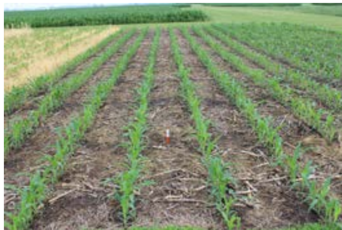
Figure 3. Cereal rye cover crop terminated 15 days prior to planting (photo taken June 11, 2018).