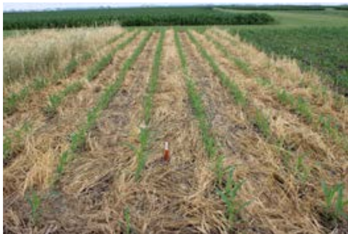
Figure 4. Cereal rye cover crop terminated at planting (photo taken June 11, 2018).