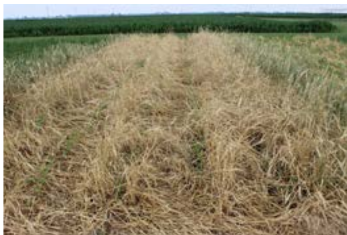
Figure 5. Cereal rye cover crop terminated 7 days post planting (photo taken June 11, 2018).