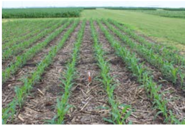
Figure 2. Cereal rye cover crop terminated 26 days prior to planting (photo taken June 11, 2018).