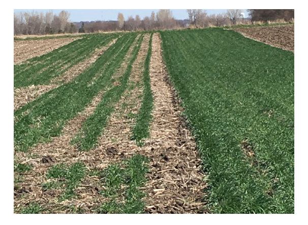
Figure 1. Field picture showing the established cereal rye cover crop used for the trial. Dense vegetation on the right is the early established cover crop and the sparse vegetation on the left is the late established cover crop. Picture was taken just before soybean planting.