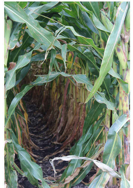
Figure 4. Nitrogen applied at growth stage VT (image taken on August 16, 2018).