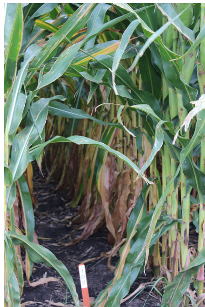
Figure 3. Nitrogen applied at growth stage V8 (image taken on August 16, 2018).