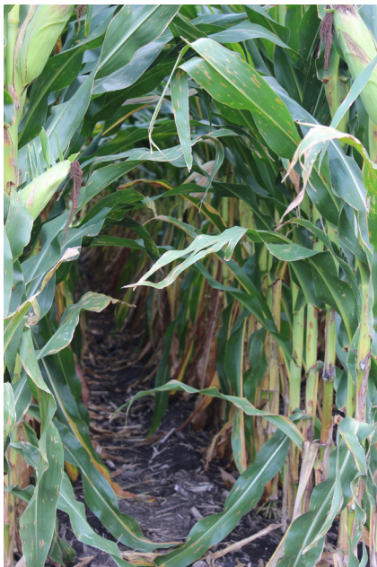
Figure 2. Nitrogen applied at growth stage V4 (image taken on August 16, 2018).